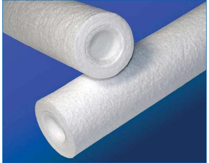
Claris Filter Cartridges